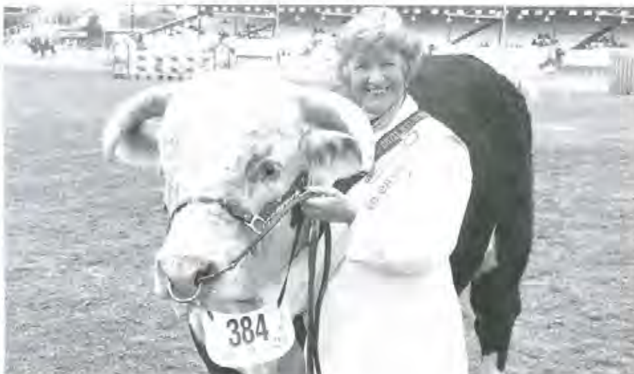
1995 Grand Champion Hereford Bull "Academy Afterthought" with his delighted handler from the Academy Hereford Stud.

Other agricultural competitions run by the Society include the Bacon and Pig Carcase, Grains, Fleece, Honey, and the Steer Carcase.