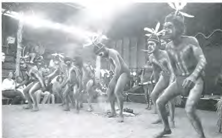
Performers at the Koori Cultural Living Centre which attracted thousands of visitors during the Royal Show.

98% of visitors enjoyed their visit to the Show and 72% enjoyed their visit 'a lot' (up from 69% the previous year), an overwhelming majority believed the changes made from the previous year were for the better, and the majority believed it was better than the last time they visited the Show.