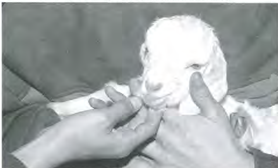
A close encounter of the cuddly kind in the Animal Nursery.