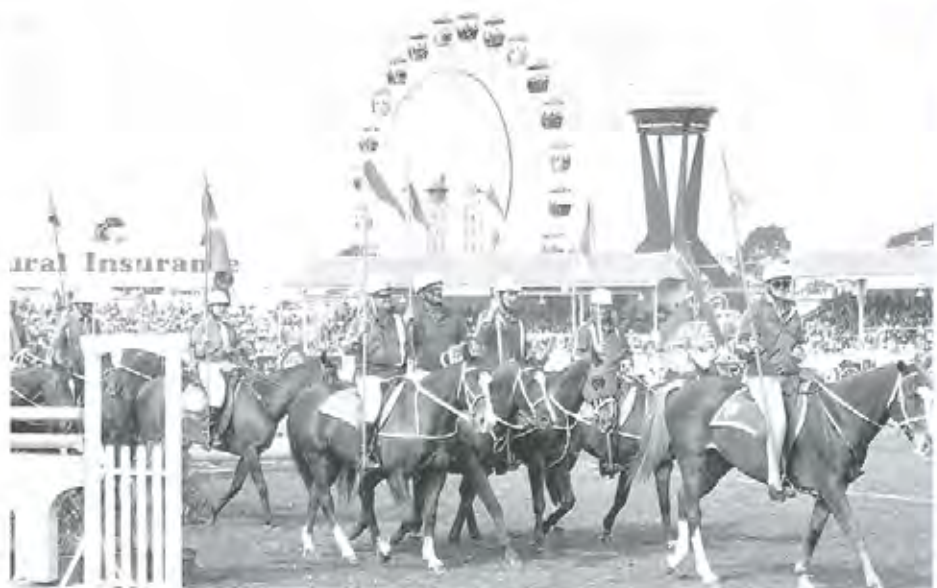
Competitors in the spectacular tent pegging competition.