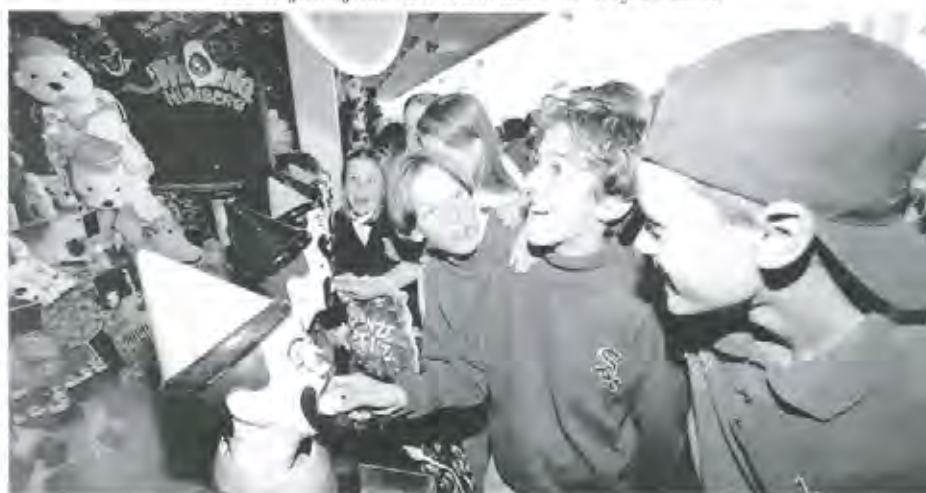
All the fun of the Amusements at the Royal Show.