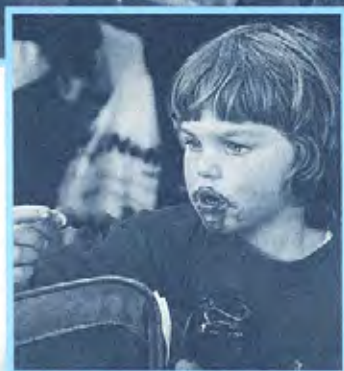
A face of enjoyment at the Show