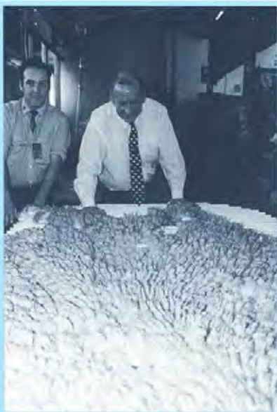
Mr Tim Fischer, Deputy Prime Minister, displays his skills in the shearing shed at the 1998 Royal Melbourne Show.

*GM Corporate Services #GM Agricultural Events & Marketing