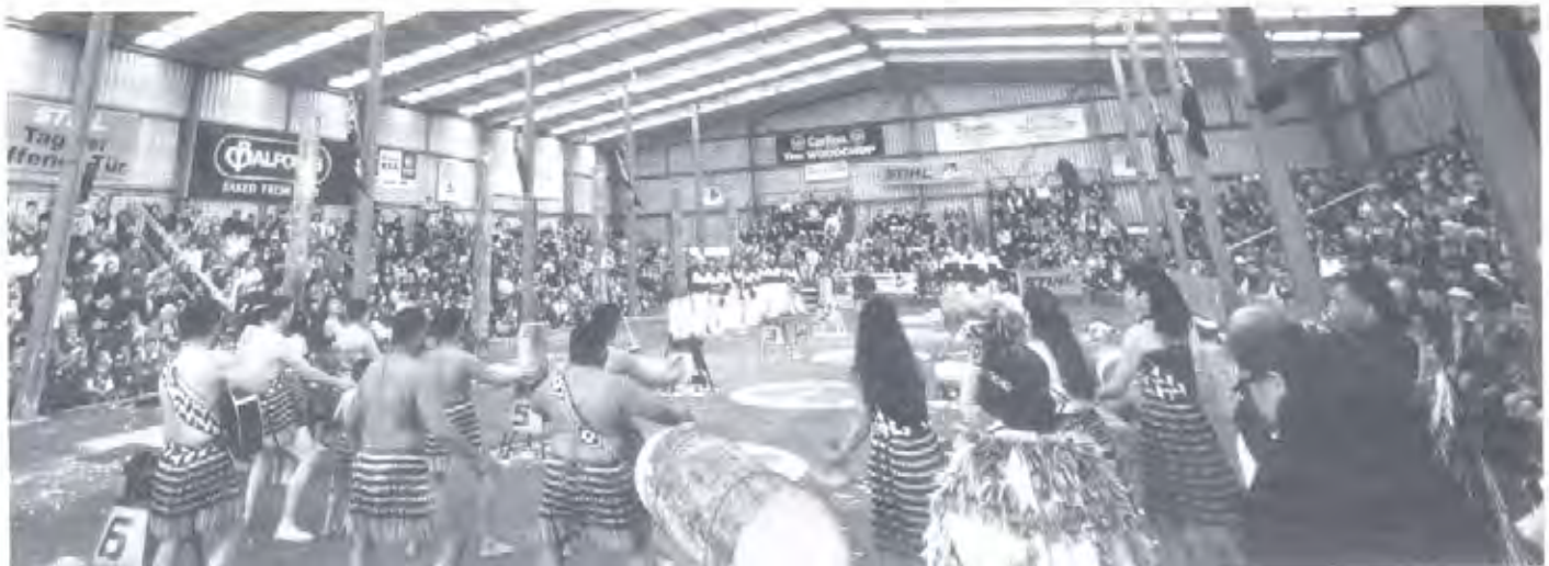
New Zealanders warm up the crowd for one of the New Zealand v Australia Test Matches in the spectacular Royal Show Woodchopping competition