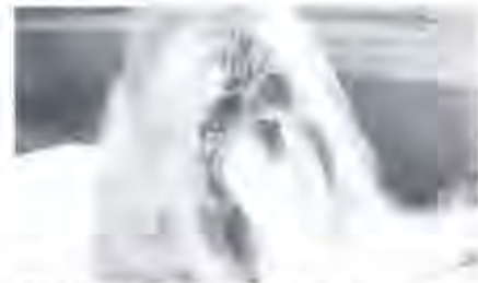
Ready to face the judges - a Shih Tzu receives the final grooming touches in the Dog competition.