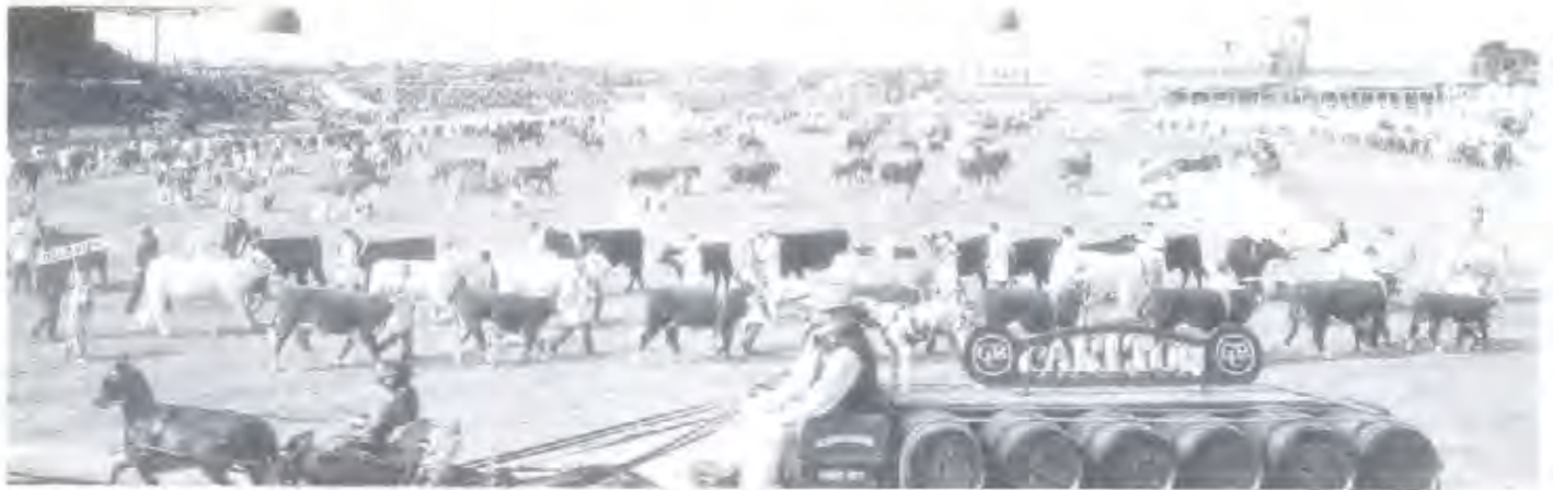
Champions on show in The Grand Parade, one of the most spectacular and popular events of the Royal Melbourne Show.

Another special feature was in Horticulture which introduced a substantially bigger line up of exhibitors in the Horticulture Pavilion and the return of the popular Floral Clock to the Showgrounds (last seen at the Show in 1965).