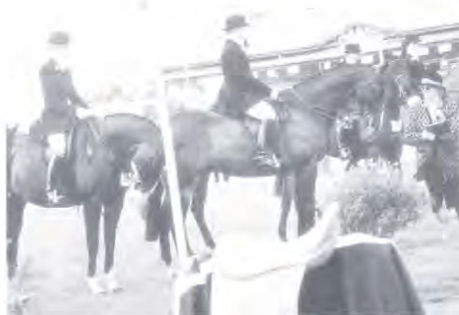
Concentration amongst the competitors in the prestigious Garryowen competition.

Other agricultural competitions run by the Society include Grains, Hay & Chaff, Fleece, Honey, the Steer Carcase and the Bacon Pig Carcase.