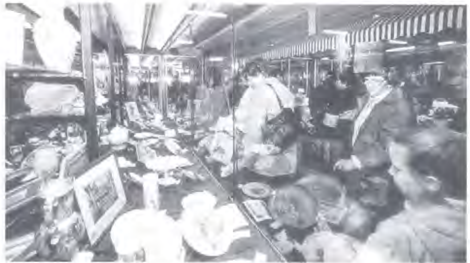
Interested visitors view one of the many art and crafts displays at the Royal Show.