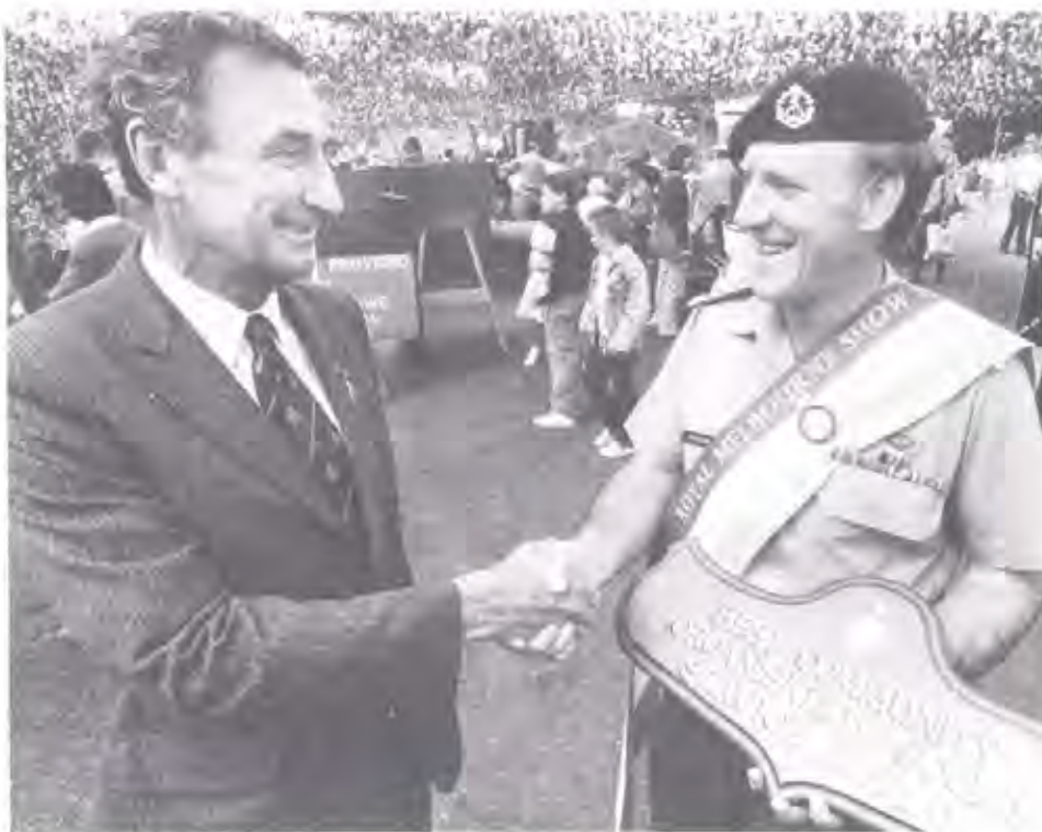
The Army display at the 1987 Show won first prize in the Community and Social Service section of the Commercial Exhibitors' Awards.

Council's decision was based on the fact that the consultant's report did not contain any positive indication that such a project could succeed at this time.