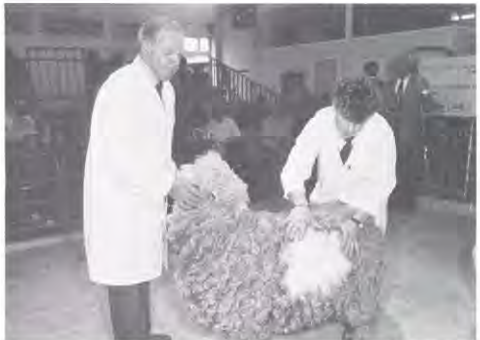
The Commonwealth Bank Farm Animal Expo represented a new concept in rural education at the Show.

Australia's mining history, the gold mining industry, development of mines and the exploration for and processing of minerals were essential components of this exhibit.