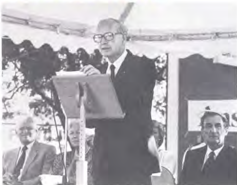
The Governor General Sir Ninian Stephen, declares ArtCraft '88 officially open.