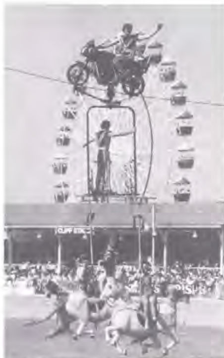
A spectacular motorcycle aerial act performed by the Brophy Brothers was a highlight of the 1987 arena programme.

AMP Lawn with its programme of music, magic, martial arts and milking