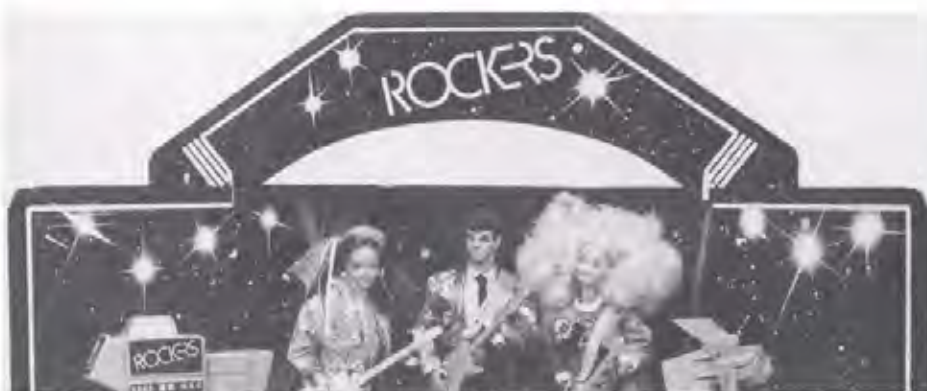
Free entertainment in the Super Kmart Childrens Theatre proved a winner with younger patrons.