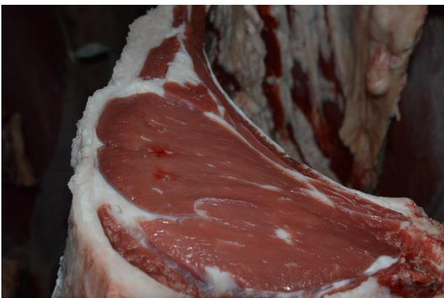
Exhibit 301, Yanco Agricultural High School (LLXMG)