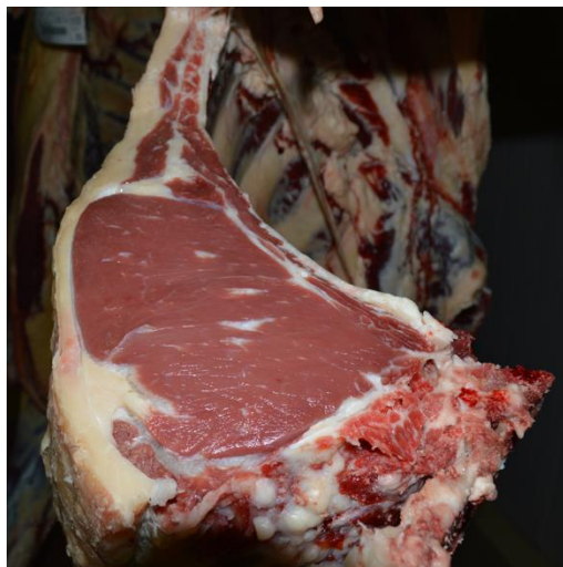
Exhibit 167, David Galpin: (LLxCC/MG),