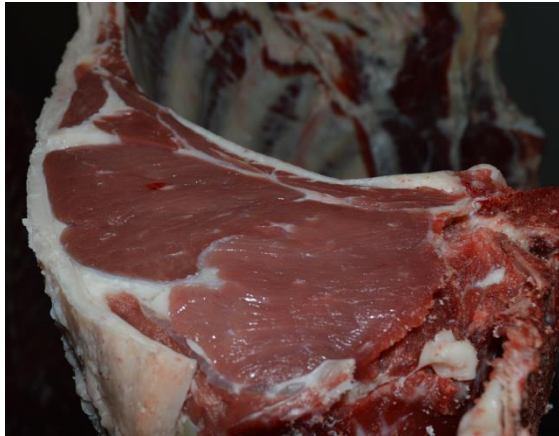
Exhibit 259, Geelong Grammar School, Timbertop: (CC/MGxAA), Sire: Lt Bridger, Dam: C02