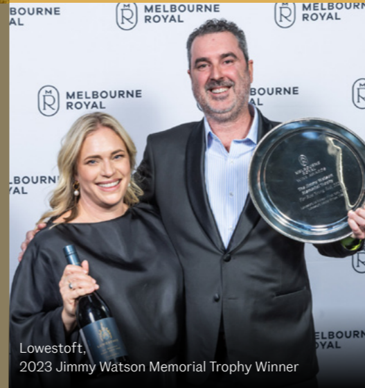
Lowestoft, 2023 Jimmy Watson Memorial Trophy Winner

The Jimmy Watson Memorial Trophy for Best Young Red wine celebrated its 60 th Anniversary at the 2023 Melbourne Royal Wine Awards Trophy Presentation Luncheon.