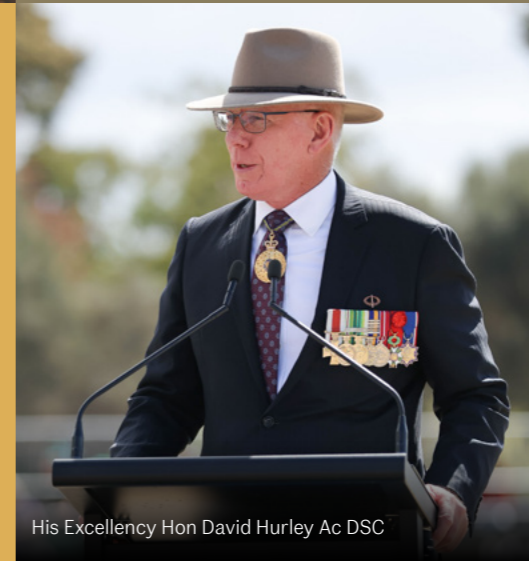
His Excellency Hon David Hurley Ac DSC

450,000 people attended the 2023 Melbourne Royal Show across the 11 days from 21 September to 1 October.