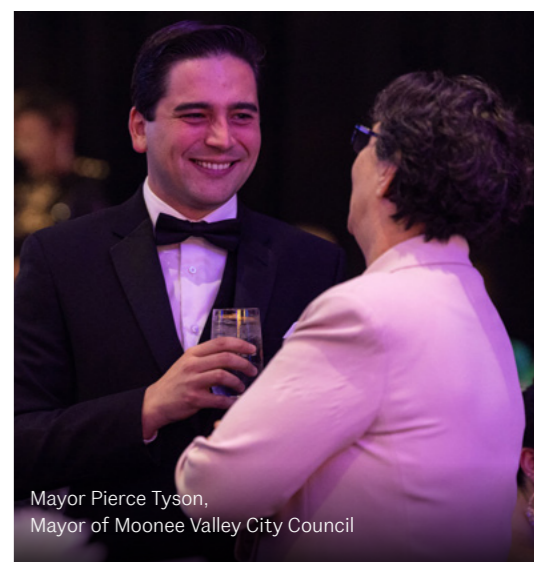
Mayor Pierce Tyson, Mayor of Moonee Valley City Council