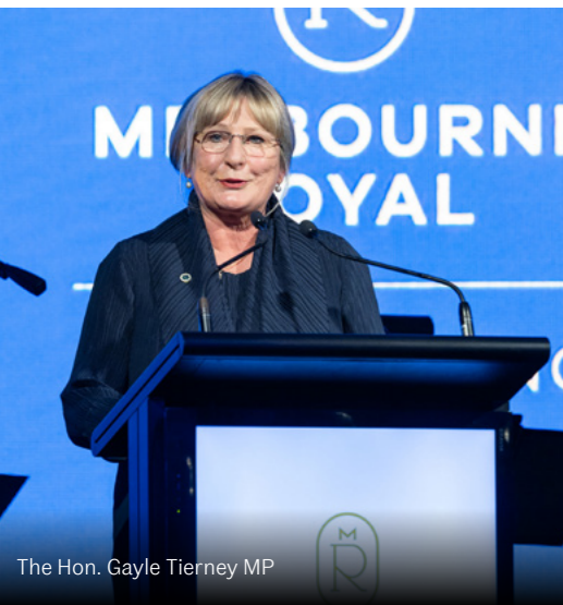
The Hon. Gayle Tierney MP