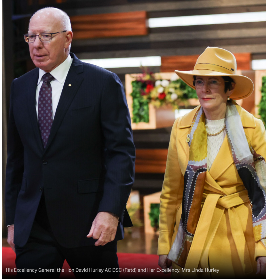
His Excellency General the Hon David Hurley AC DSC (Retd) and Her Excellency, Mrs Linda Hurley