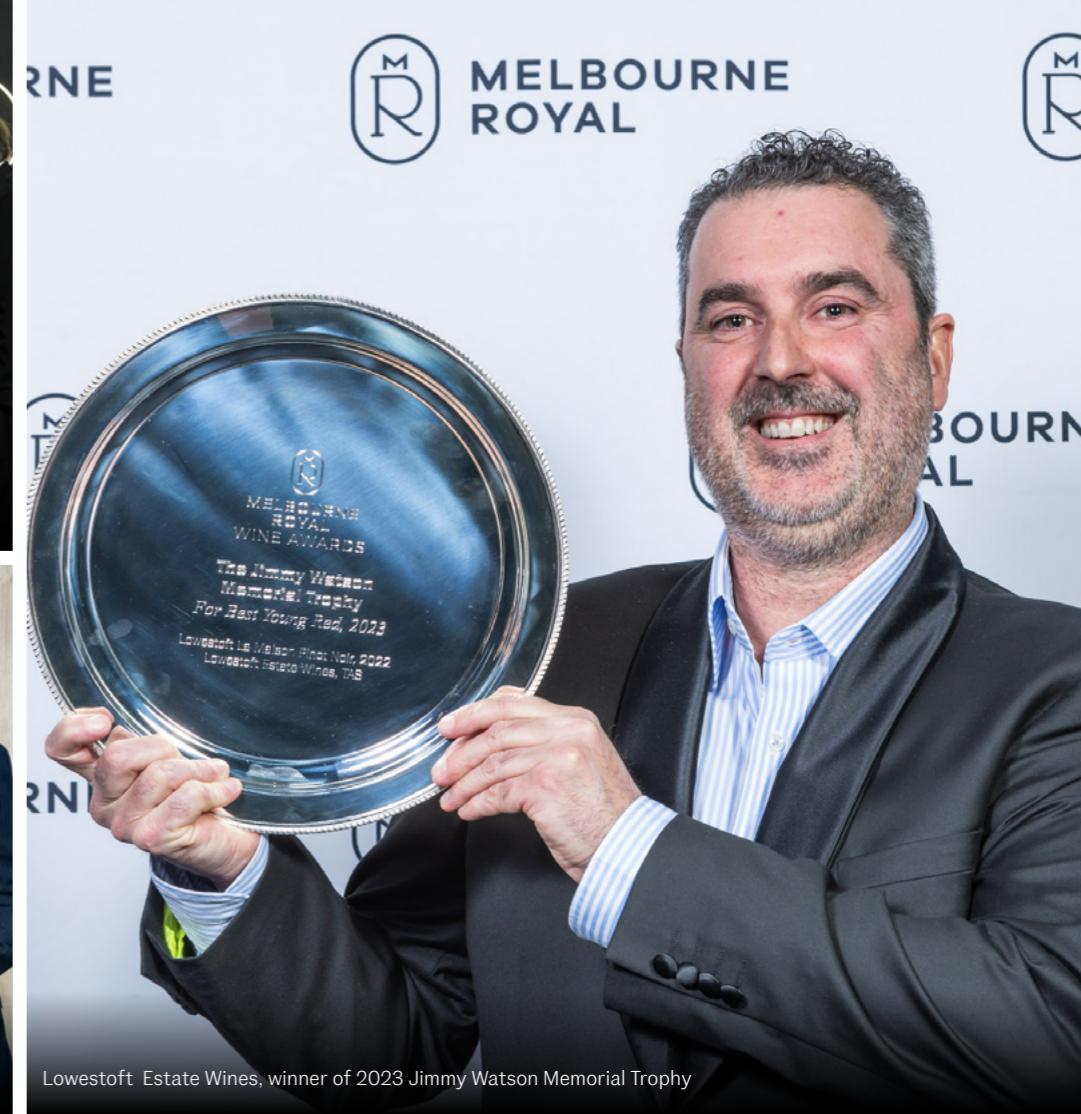
Lowestoft Estate Wines, winner of 2023 Jimmy Watson Memorial Trophy